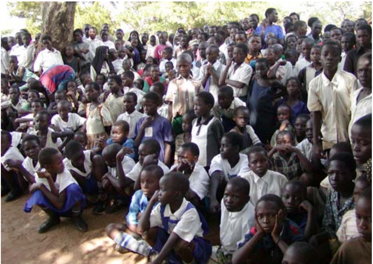
The Rights of the Child and a Sustainable Development was in the focus of the Seminar and Workshops. The picture is from the inauguration of the Children’s Meeting Place in Busia, Uganda.