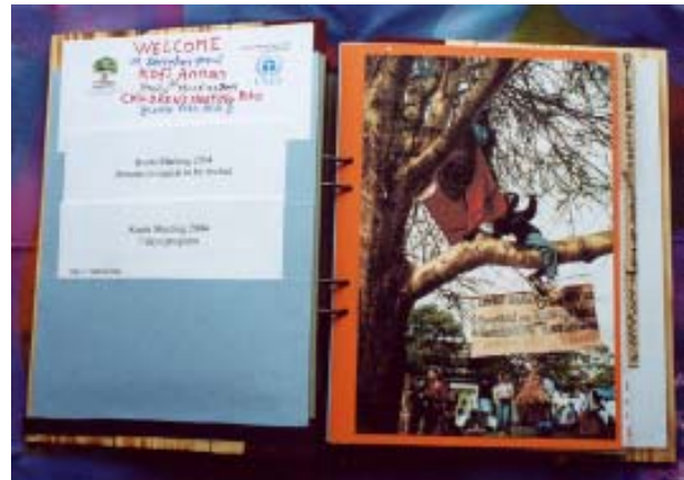
A file with invitation, pictures and drawings made by the children was sent to Secr. Gen. Kofi Annan.

A new tradition at the Children’s Meeting Place - “The Mother Tree”, evolved on the Christmas Day when fifty orphanage children came together and celebrated Christmas. What a day! Children played together, sang, made drama and storytelling. We told them about the International Roots Meeting and the children wished Secr. Gen. Kofi Annan to be their Guest of Honour. Each one of the orphanage children found a place to write and make drawings. A few took place at a table, some used one another’s backs and some climbed their tree where the branches gave good support for the important assignment of making the invitation. Some of the children had never before been using paper and pens but the result was full of fantasy and very beautiful: KOFI ANNAN YOU ARE VERY WELCOME TO THE CHILDREN’S MEETING PLACE!