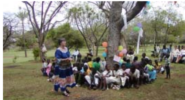
The preparation of the Children’s Meeting Place around the tree Ficus thoningi.

The children’s tree is a Ficus thoningi and is a good habitat for birds as the seeds are so delicious. The seeds are sterile but can be made to germinate after going through the digestive system of the birds. When the birds visit other trees the droppings can land in forks of the tree. The seeds start growing - down to the roots and engulf the tree – strangles the tree to death. A natural process of taking care of old trees. The tree can also grow in cracks of walls and in other difficult conditions signifying the difficult conditions in which the African children grow up.