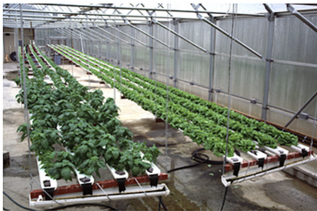
Lettuce and basil plants growing in the "conveyor production system" in Shepherdstown, WV

dropped below the critical deficiency level (0.35-0.4% P on a dry weight basis for lettuce). At that point, P deficiency symptoms appeared, plant growth decreased, and the plant quality became unmarketable. We developed the conveyor production strategy (described below) to sustain plant productivity and health while removing dissolved P levels to less than 0.01 mg/L.